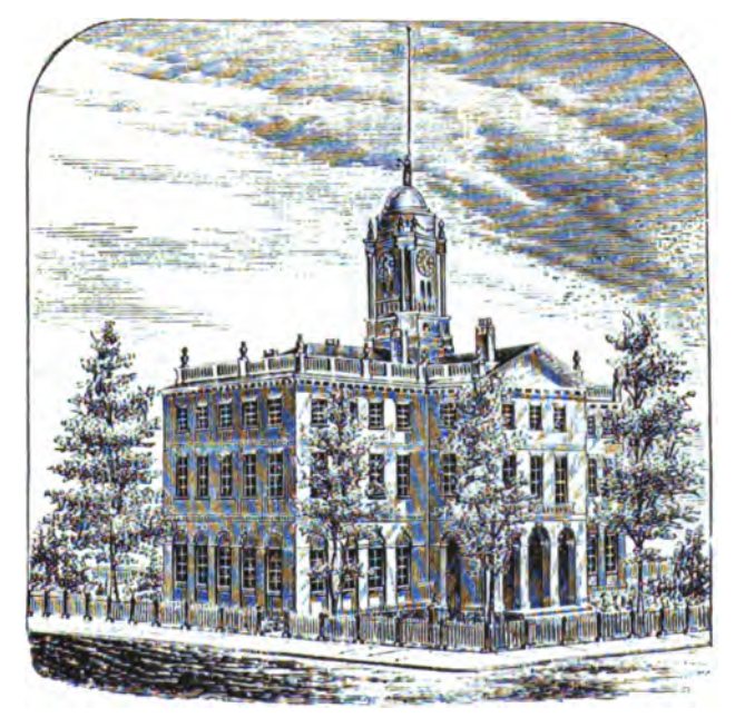
SECOND STATE-HOUSE AT HARTFORD. Commenced in 1792; occupied in 1795.